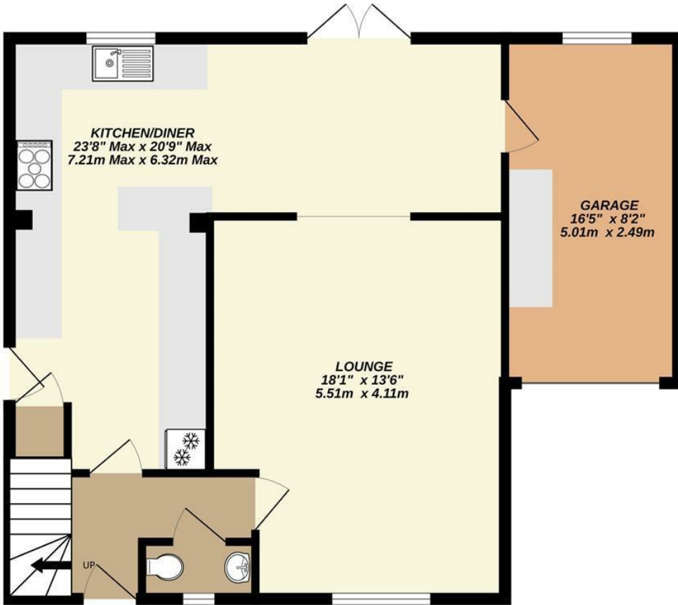
GROUND FLOOR 765 sq.ft. (71.1 sq.m.) approx.